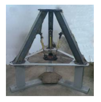
a ) - frame layout three coordinate drill-mill machinetool with MPS [7]

[4]. The computer receives signals of machine-tools EE zero position sensors. The controller has three independent axes in three coordinates and works by STEP/DIR (step/direction) protocol with LPT computer port in real time. The controller receives information on the steps number and direction of rotation that has to execute by step motors.