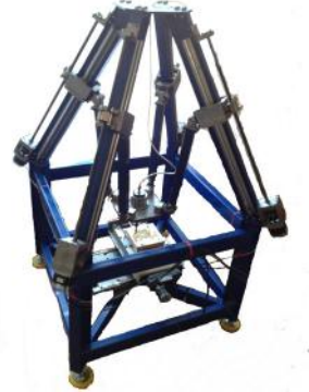
b) - frame layout five coordinate drill-mills machine-tool with MPS [5, 7]