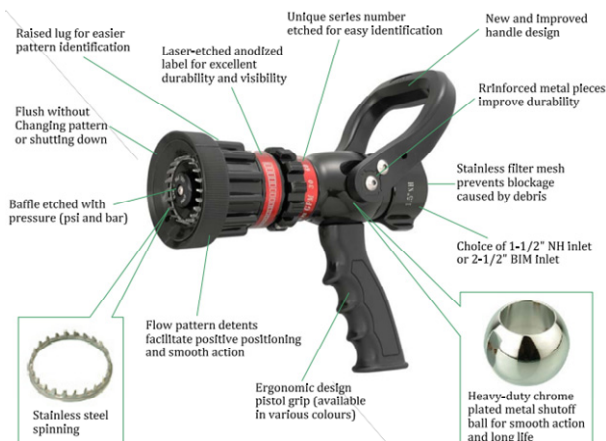
Fig. 1. Handline nozzle PROTEK-366 [6]

For water supplying and aqueous foaming agents for extinguishing fires, were used jet-forming devices - handline nozzles. There are manual and carriage handline nozzles. Due to the specifics of firefighting tactics, manual handline nozzles are the most commonly used. Until recently, in Ukraine were used manual handline nozzles of structures developed in the 60s and 80s of the last century, and they were outdated both technically and morally. So happened that the handline nozzle Protek 366 became widely used in Ukraine (SPRK) (Fig.1), which replaced the handline nozzles of the RS-50 (RSK-50) and RS-70 (RSK-70) type. Unlike them, Protek 366 handline nozzle has a wide range of nozzle flow adjustment (Fig.2) and the ability to adjusting the spray angle of the jet from compact to sprayed.